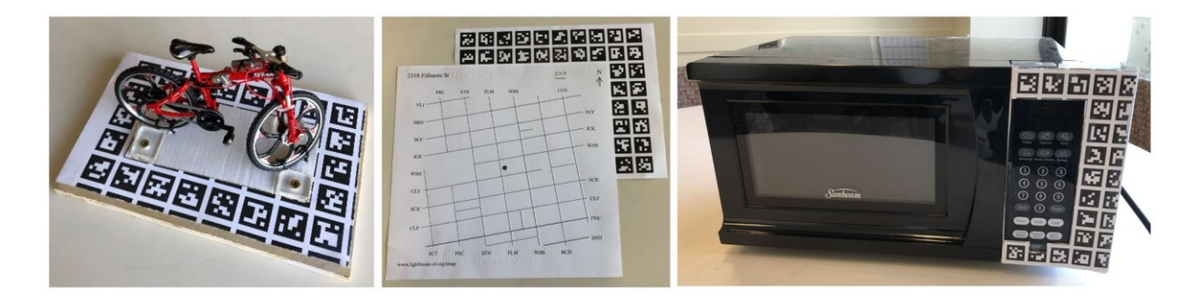
Fig. 2. Remaining objects used in the user study. Left to right: (a) 3D bicycle model rigidly mounted on the board used in the training session. (b) Tactile map (TMAP) of the neighborhood near Smith-Kettlewell in San Francisco, which is attached to the board. (c) Microwave oven, with a board mounted to the side of the touch panel.

label it with a futuristic solution. To analyze participant responses, we used an inductive grounded in vivo coding technique.