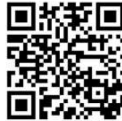
Website QR Code

The Blind and Low Vision Support Group is resuming! Monthly meetings start on Wednesday February 19th, at the Smith-Kettlewell Eye Research Institute. No cost is involved, and all are welcome to attend.